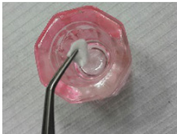
Figure 3 Aloe vera sponge in dappen dish.