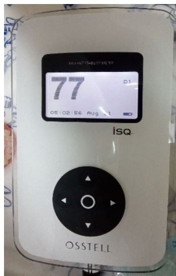
Figure 5 Digital screen of osstell device reading the implant stability.