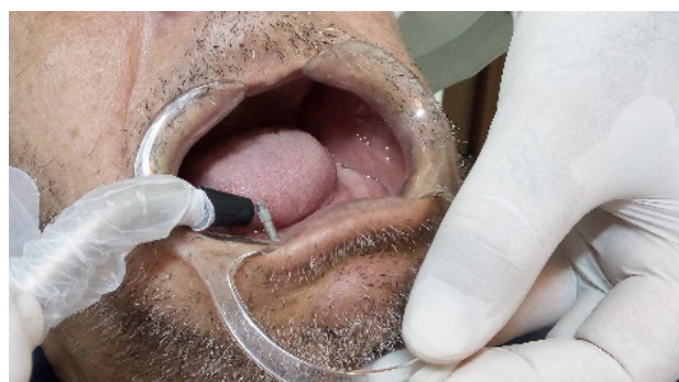
Figure 4 Smartpeg is connected to the fixture during measuring the implant stability.