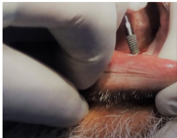
Figure 2 Implant placement.