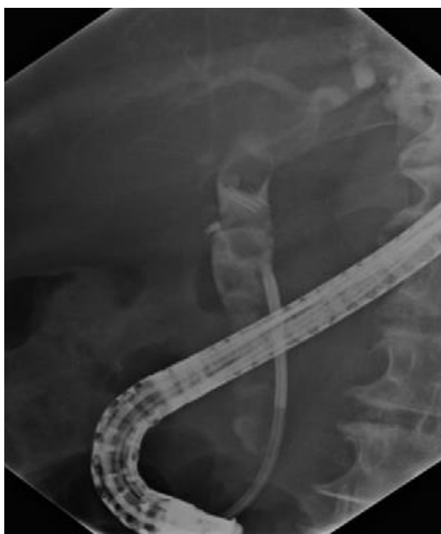
Figure 2 Cholangiography showing choledocholithiasis.

The reported incidence of complications with ML ranges from 6%