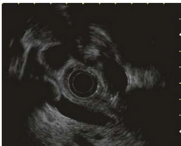
Figure 3 EUS showing choledocholithiasis.