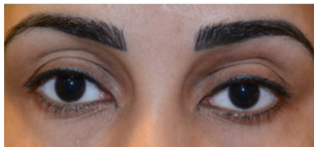
Figure 3 After treatment showing restoration of symmetry of both upper eyelids.