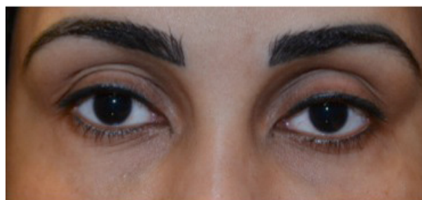
Figure 2 Before treatment showing increased hollowness of the left medial upper eyelid, compared to the contralateral side.

The cannula is then introduced down to the level of the subcutaneous fat and the HA is injected and massaged afterwards, taking advantage of the superior orbital bone rim by pulling the skin superiorly to bring the area augmented to rest over the bony background. This is done to mold it to the desired end point. Extreme care should be taken when working around regions of major vessels (supratrochlear and supraorbital vessels). The technique maybe viewed on https://youtu.be/nD8jl4OWUxk .