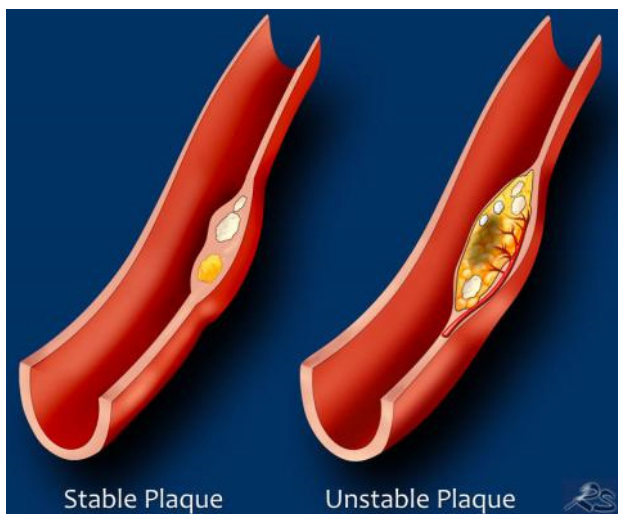
Figure 1 Features of stable and unstable/vulnerable plaque with thin-cap fibro-atheroma; gratefully acknowledged and reproduced from reference 29.

At present, Coronary CTA may be more appropriate to the patients in the low-risk NSTEMI/ACS. Without elevated cardiac biomarkers and in the absence of recurrent chest pain, it is recommended that this cohort should undergo a stress test to look for evidence of inducible ischaemia. Coronary CTA is recommended in this cohort only if the stress test demonstrated significant ischaemia. Coronary CTA may replace the stress test as the first investigation in this cohort, if the stress testing is inconclusive. Table 2 shows the Coronary CTA protocol. Table 3 shows the pre-medications for Coronary CTA. Table 4 shows the contra-indications to Coronary CTA.