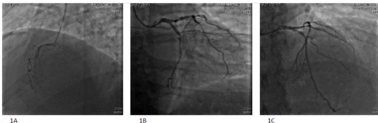
Figures 1A. Chronic occlusion of right coronary artery; 1B. Sub-occlusion of left descending artery (LAD) due to in-stent proliferation re-stenosis and in-stent chronic occlusion of marginal artery; 1C Successfully result of percutaneous coronary intervention (PCI) both on LAD and marginal arteries.