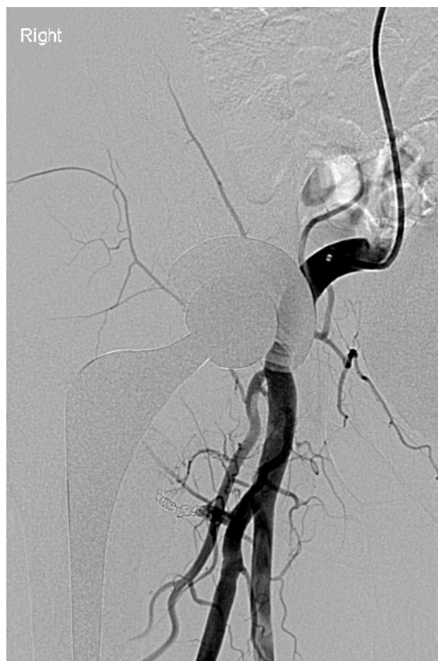
Figure 4 Angiogram post occlusion of pseudoaneurysm with multiple coils.

which significant bleeding occurred intraoperatively when an anterior osteophyte from the acetabulum was removed using an osteotome. However, no bleeding point was identified at the time of surgery. The patient was stabilised following blood transfusions but on day 18 was anticoagulated following cerebral infarction. Pseudoaneurysm of the profunda femoris artery at the level of the lesser trochanter was diagnosed on angiography 39 days post operatively following wound breakdown [2] . Lund et al described a case of pseudoaneurysm of the medial circumflex femoral artery following cemented Charnley Elite system using the anteromedial approach however, the timeframe of diagnosis was not reported by the authors [1] . Hall et al described a case of avulsion of a posterior branch of the profunda femoris artery following primary hip arthroplasty; the approach used was not documented. Again the patient became unstable immediately postoperatively with falling haemoglobin despite 9 units of blood transfused [8] . The patients in all of these cases had an increasing non-pulsatile thigh swelling [1,2,7,8] .