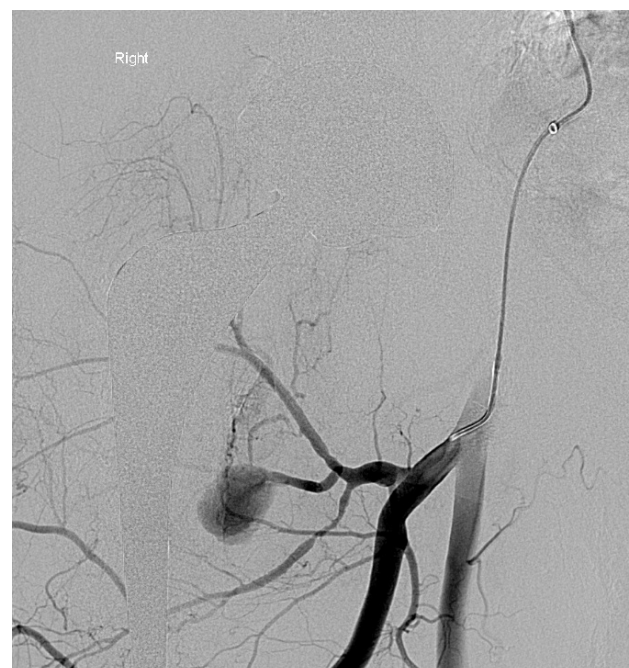
Figure 3 Angiogram appearance of pseudoaneurysm of lateral segmental branch of profunda femoris artery and relation to stem of hip prosthesis.