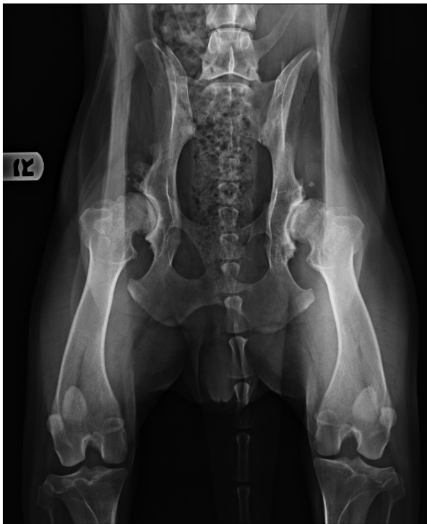
Figure 1 Ventrodorsal radiograph of the hip of a German Shepherd 33kg with bilateral degenerative joint disease.

Growth factors were first classified by Canalis in 1988 [35]